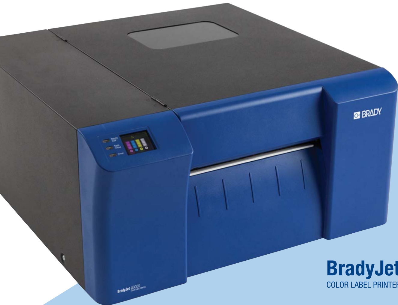
BradyJet J5000 COLOR LABEL PRINTER