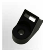
Heavy Duty Impact Resistant Screw Mounts