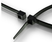
Impact Resistant Cable Ties