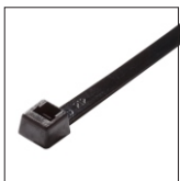
Standard Cable Ties