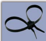
Dual Loop Cable Ties