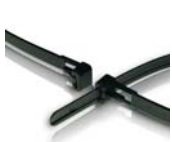
Releasable Cable Ties