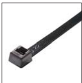
Standard Cable Ties