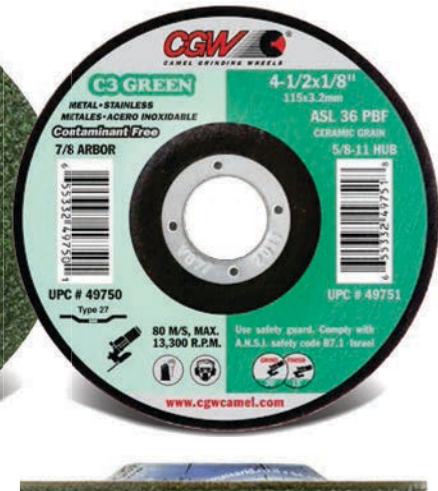
1/8" / 3.2mm / .125