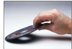
ZA36-T – Rigid